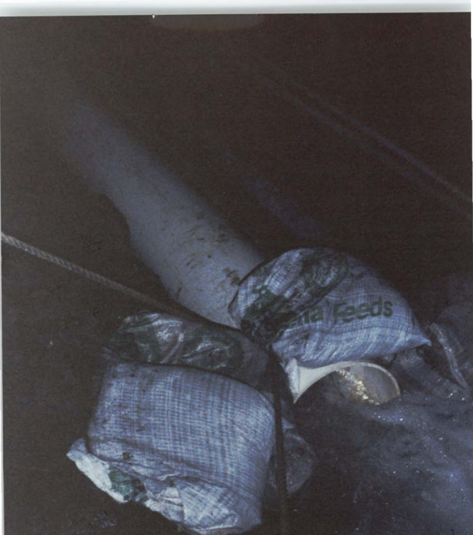
EXHIBIT S-66 000001